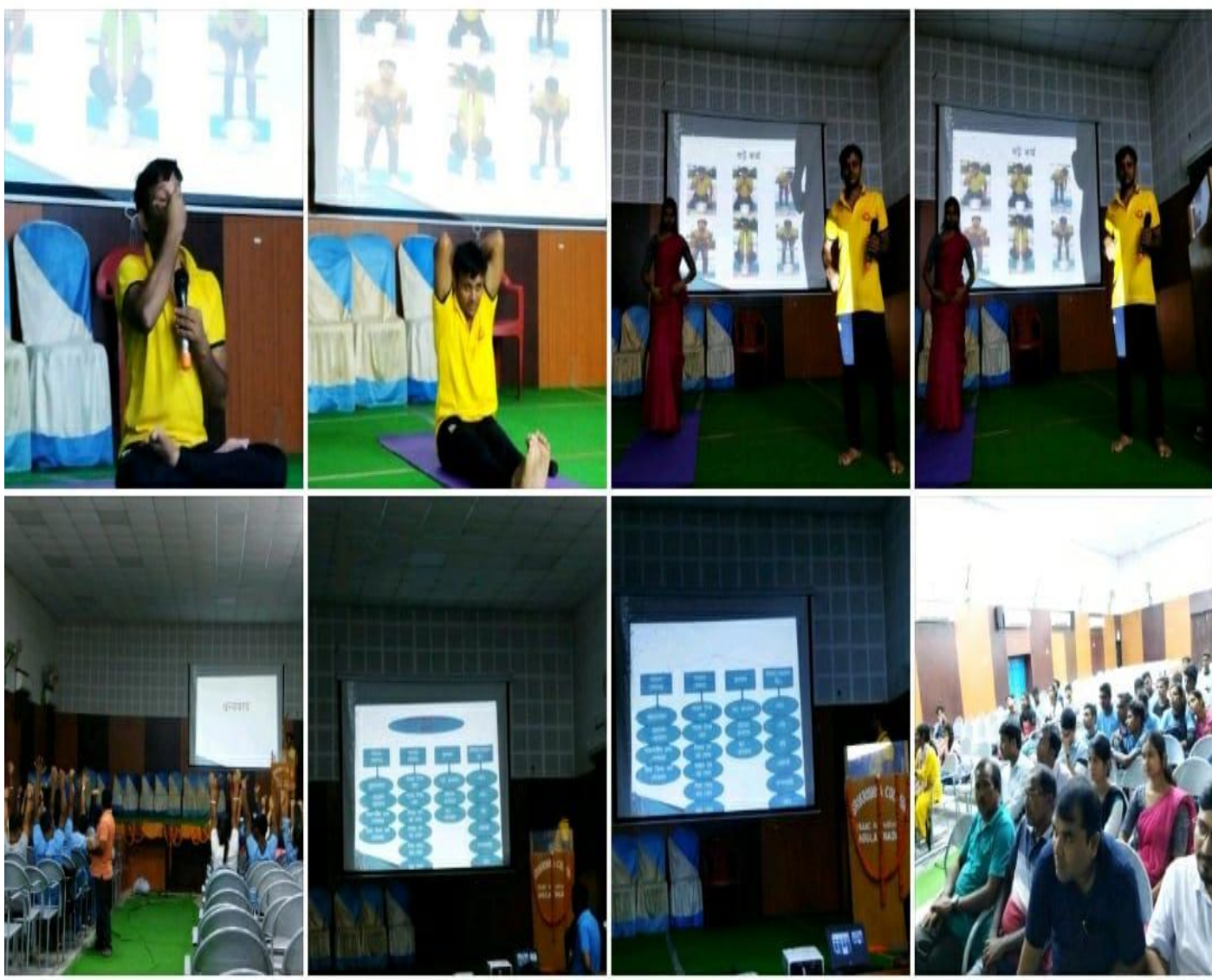
Dept. of Sanskrit, Srikrishna College Bagula, Nadia, West Bengal